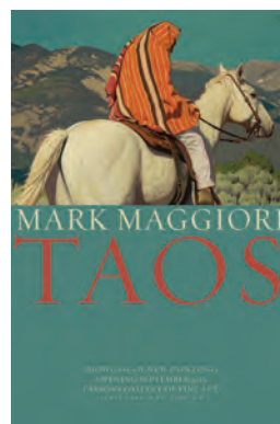
The poster for Mark Maggiori’s September 2020 exhibition is an emblem of the partnership to expand an arts education program for Taos Day School students and beyond.

CSHS has reached out to other members of the Taos community for volunteers to coordinate the growth of our education program beyond TDS, to introduce more local students to the rich heritage of early Taos art.