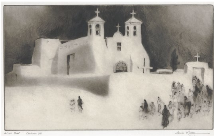
Centuries Old , 1979, etching, drypoint and aquatint, 12 1/2 x 19 1/4 in. Anonymous Gift. Harwood Museum of Art.