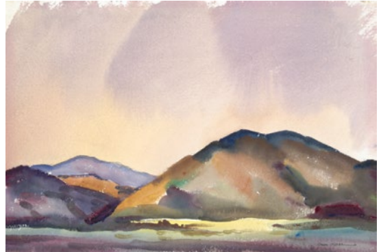
Untitled , ca. 1930, watercolor, 9 1/4 x 14 1/16 in. Gift of Ila McAfee Turner. Harwood Museum of Art.

combination of etching, drypoint and aquatint, depicts the interior of the iconic Ranchos de Taos Church (San Francisco de Asis) that Kloss created from memory after attending a Sunday mass. In a letter she wrote, “I was in a way an outsider as I am not a Catholic, so the ritual was not familiar nor understood by me. However the ‘feel’ of a church, whatever the creed or its expression, can be experienced by anyone of a basically, what we call a ‘religious nature.’ Art is what I call plastic