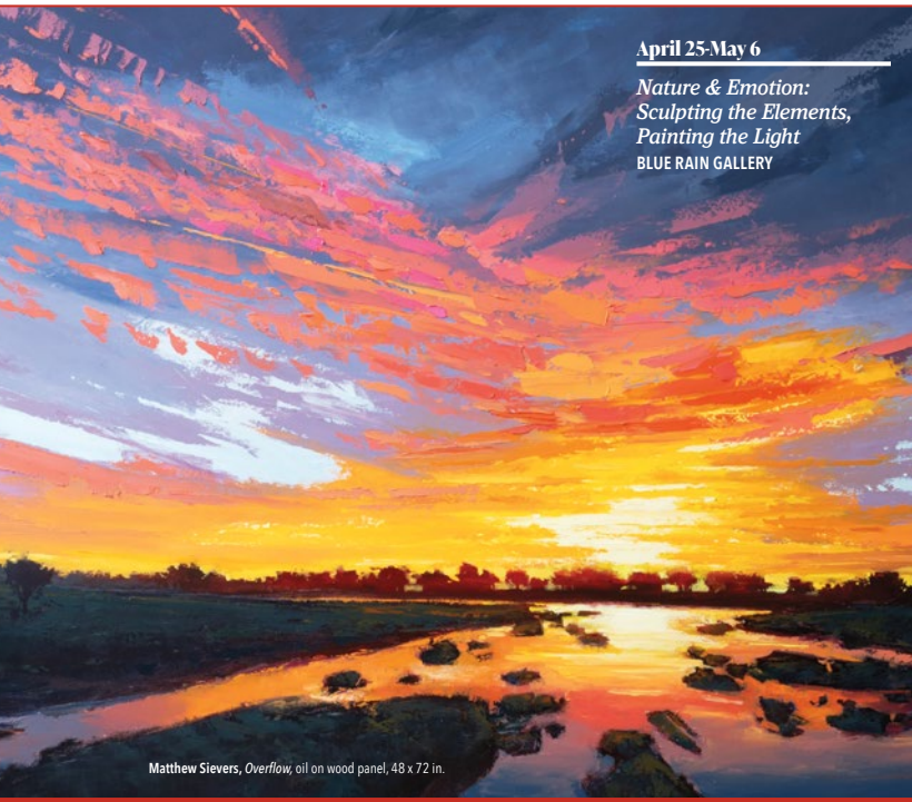
Matthew Sievers, Overflow , oil on wood panel, 48 x 72 in.