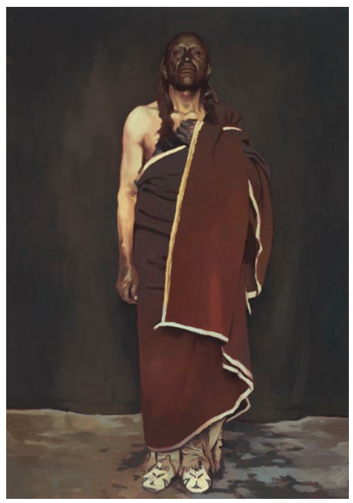
\label{eq:mark-maggiori} \textbf{Mark Maggiori}, \textit{Buffalo Dancer}, \texttt{2021}, \texttt{oil on linen}, \texttt{40} \times \texttt{28}". \\ \textbf{Couse-Sharp Historic Site, museum purchase, 2021}.