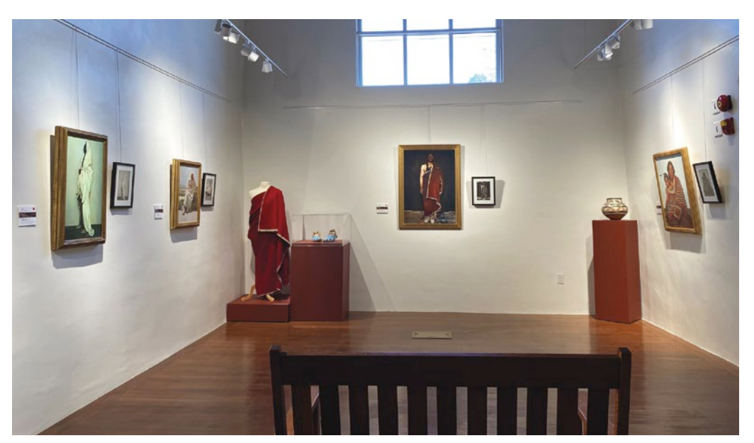
The Lunder Research Center at the Couse-Sharp Historic Site.