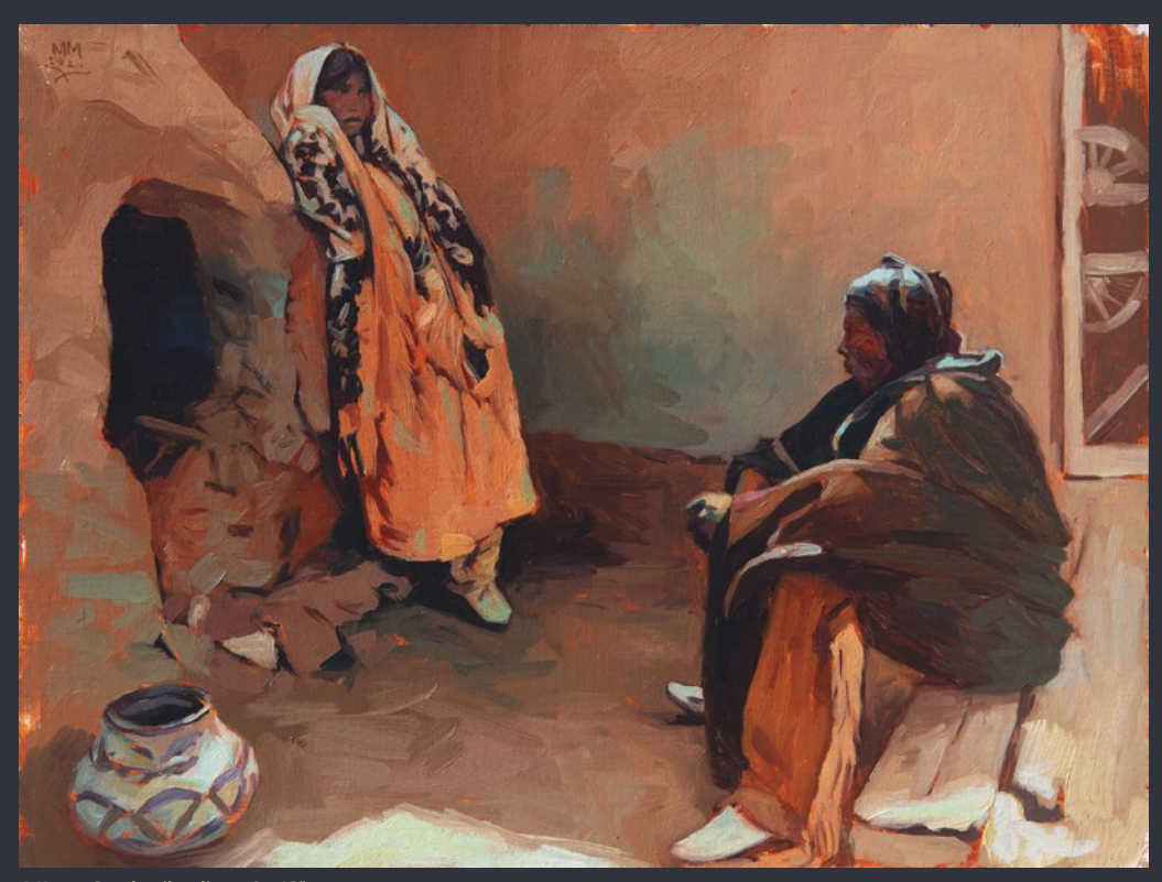
A Young Couple, oil on linen, 9 x 12"

time machine. Right away I asked if I could do a show on the images, just to really make a showcase of Couse's work to open the Lunder Research Center."