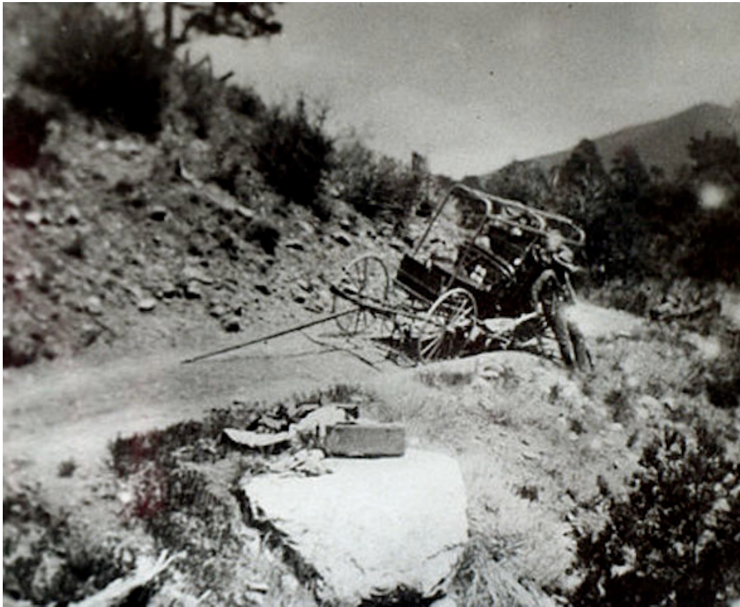
The broken wagon wheel that started it all.

Eureka! They had found exactly what they were looking for: that incredible light, an endless horizon with its blue skies, captivating clouds, stunning sunsets, the majestic, mysterious mountains, the rolling, frolicking Rio Grande, and picturesque Native and Hispanic cultures. Phillips settled in Taos, but Blumenschein returned east. Phillips said to Blumenschein, “For heaven’s sake, tell people what we have found! Send some artists out here. There is a lifetime’s work for twenty men.”