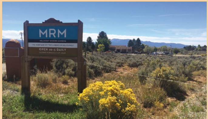
The Millicent Rogers Museum near Taos, New Mexico.