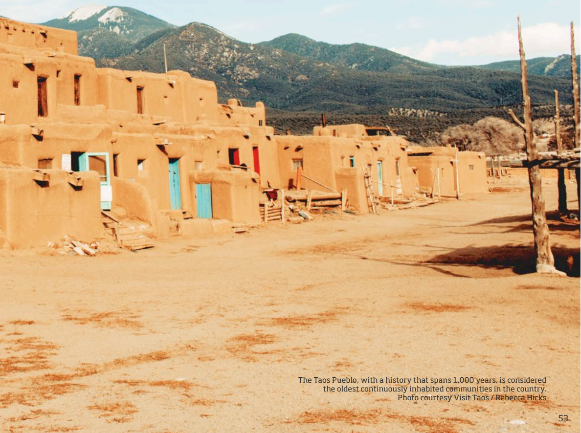
The Taos Pueblo, with a history that spans 1,000 years, is considered the oldest continuously inhabited communities in the country.