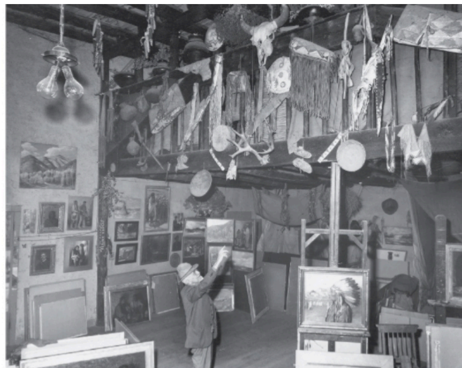
Joseph Henry Sharp inside his studio in Taos, New Mexico.

Joseph Henry Sharp's Old War Chief's Son is on display in the recently renovated Luna Chapel, Sharp's first studio in Taos, New Mexico.