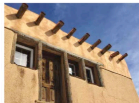
The Luna Chapel in Taos.

Joseph Henry Sharp's Old War Chief's Son is on display in the recently renovated Luna Chapel, Sharp's first studio in Taos, New Mexico.