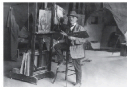
Joseph Henry Sharp at his easel in the Luna Chapel.

purpose of each of these curious designs has never been explained.