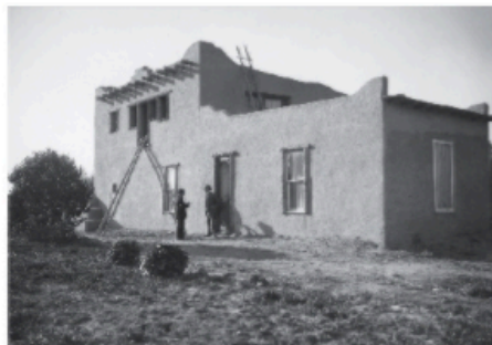
An undated historic photo of the Luna Chapel.

Koenig says the renovation also preserved two oddities in the original design: a second-floor doorway from a loft that leads to a drop-off on the side of the building; and a "round-square" window, round on the outside and square on the inside. The